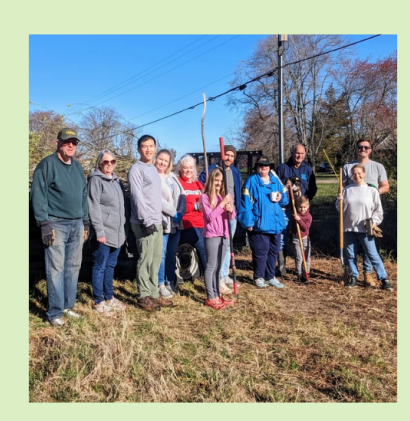
Ditch Clean Up